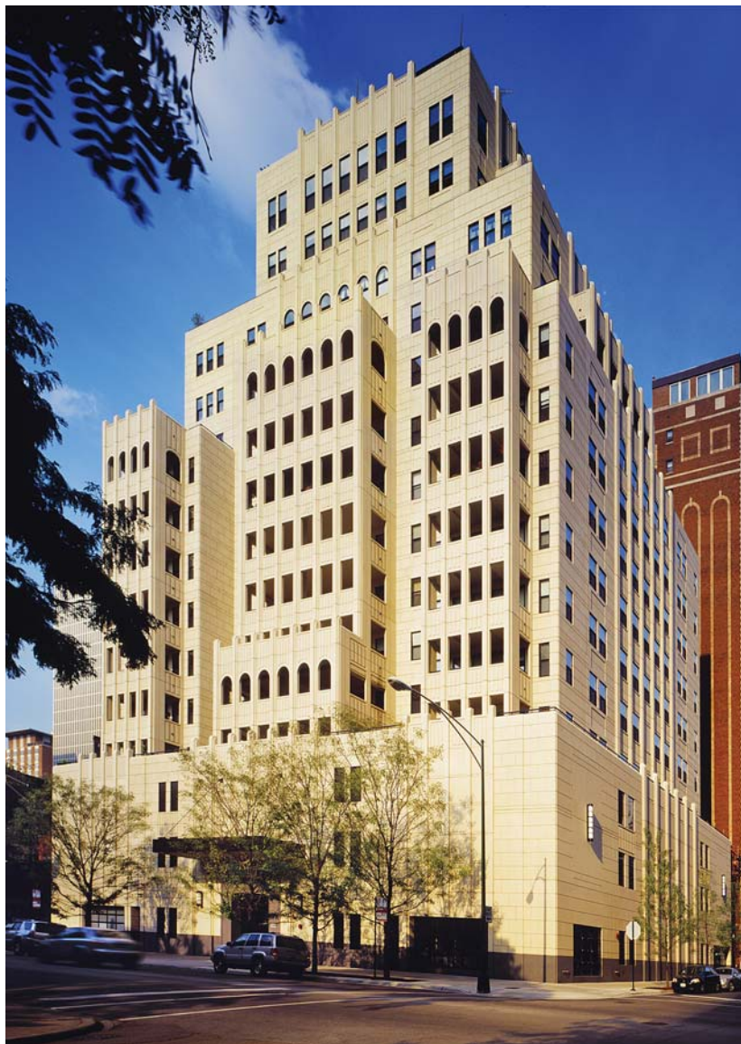
Elm Tower CHICAGO, ILLINOIS