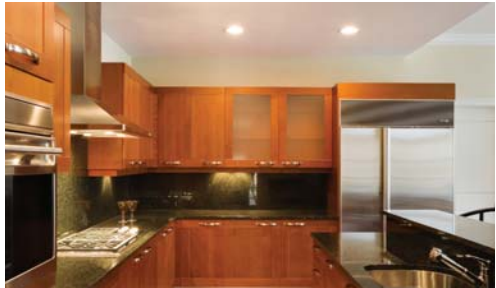
Maple Tower CHICAGO, ILLINOIS

Working with JDL Development Corporation, Epstein served as architect and engineer of record for two recently completed high-rise condominiums in Chicago, Illinois. Elm Tower is a 16-story development consisting of 39 residential units and a three-level parking garage and Maple Tower is a 21-story building with a two-story commercial/retail space. The positive experience JDL encountered with Epstein has resulted in two additional projects currently in design; The Mercer , a high-end residential complex in Las Vegas and 541 West Cornelia , a 21-story unit luxury condominium in Chicago.