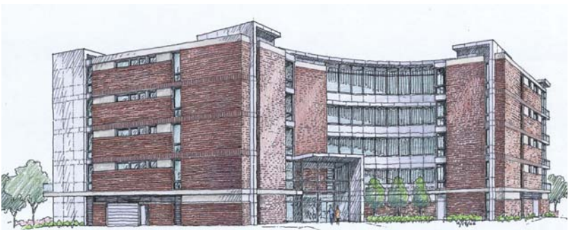
Hudson Pointe South NORTH BERGEN, NEW JERSEY

One of these repeat performances is Hudson Pointe South , a project that Epstein is currently providing architectural design services to K. Hovanian Homes in North Bergen, New Jersey. This project came to Epstein through the direct result of our work on The Lofts @ Port Imperial , an 11-story mixed-use residential building along the Hudson River in West New York, New Jersey. K. Hovanian Homes was impressed with the architect of record and interior design work Epstein provided on The Lofts that the firm was contracted to design this 24-unit condominium