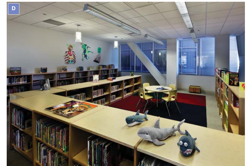
The British School of Chicago CHICAGO, ILLINOIS