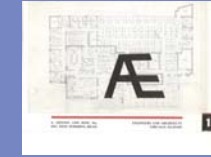
Issue #1 - 1958

Epstein's Design Profile is a brief in-house publication addressing our recent design and construction projects and discussing today's industry challenges.