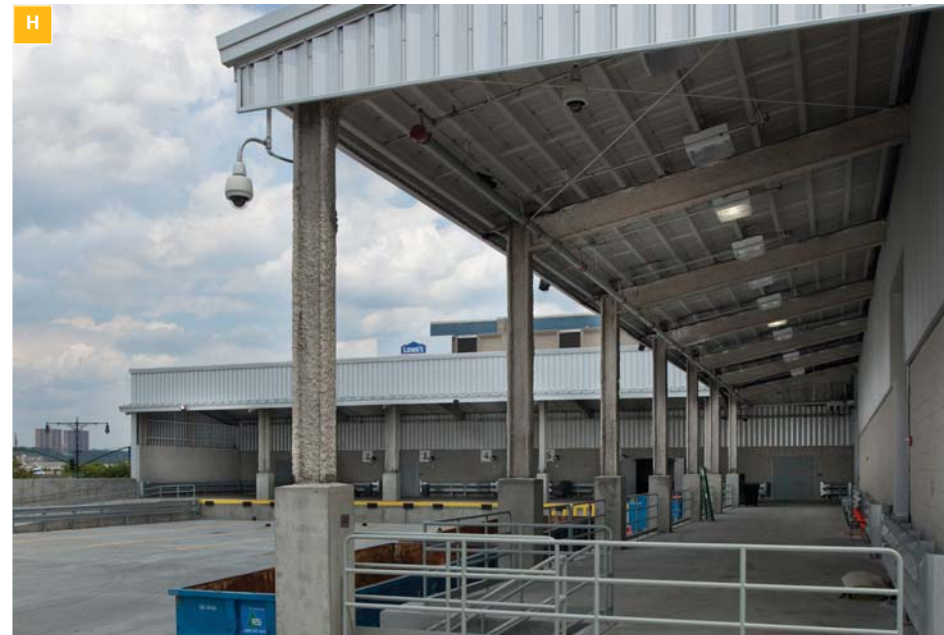
D: "The Link" with View to the Entrance to the North Hall E: Outdoor Plaza F: Detail of Concourse Entrance G: View from Exhibition Hall to Entrance into "The Link" H: Truck Court & Loading Dock