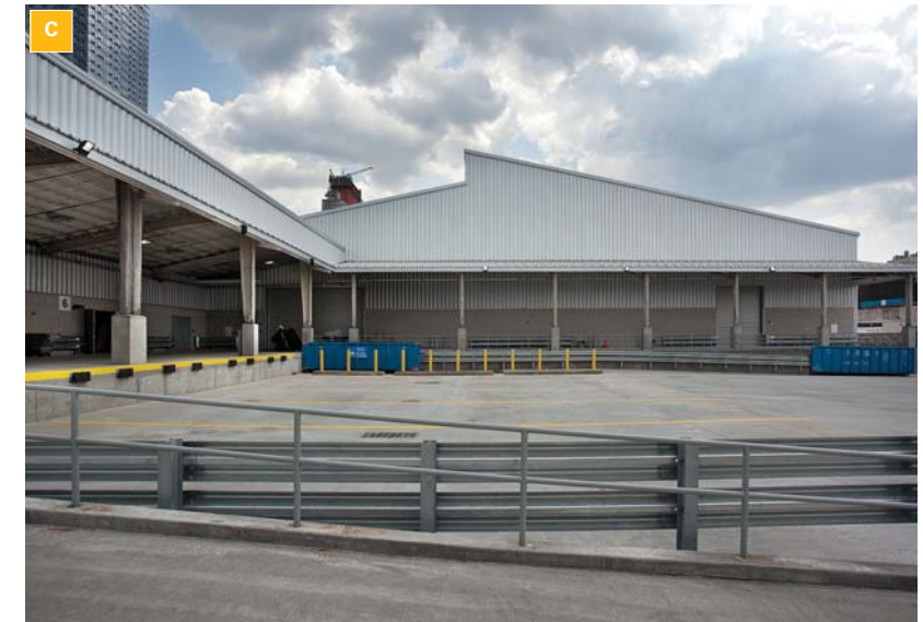
Jacob K. Javits Convention Center North Hall NEW YORK, NEW YORK