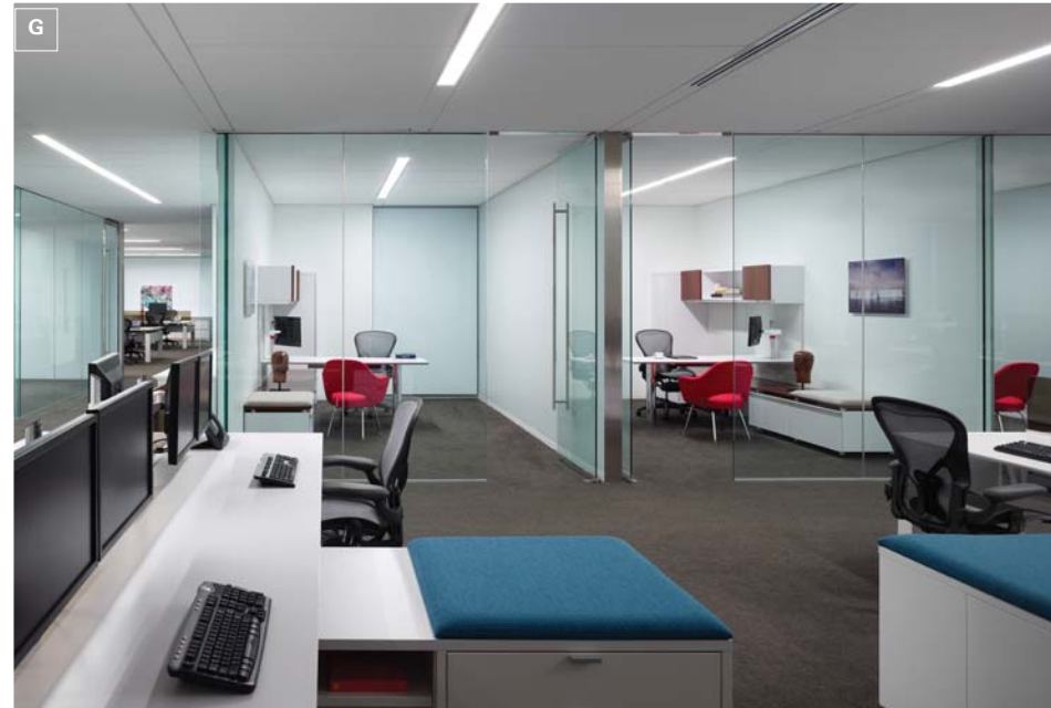
D: Conference Room and Breakout Lounge E: Executive Office with View to Open Workstations F: Boardroom G: Open Workstations