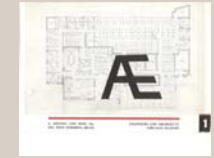
Issue #1 - 1958

Epstein's Design Profile is a brief in-house publication addressing our recent design and construction projects and discussing today's industry challenges.