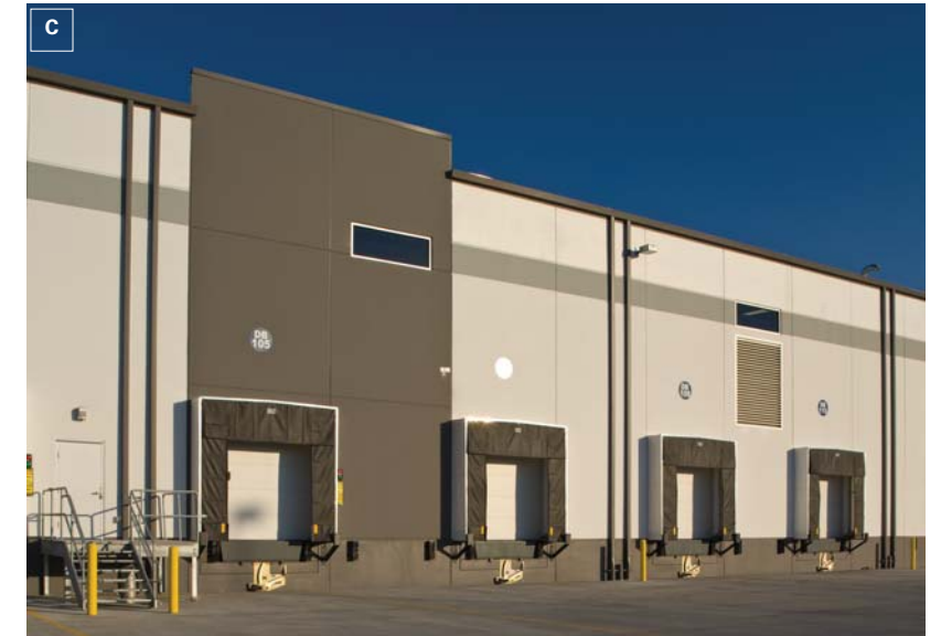
Whirlpool Corporation "Project Zenith" MULTIPLE LOCATIONS, UNITED STATES & CANADA

A: McDonough, Georgia Entrance Elevation B: Columbus, Ohio Warehouse Racking C: Columbus, Ohio Warehouse Dock Detail