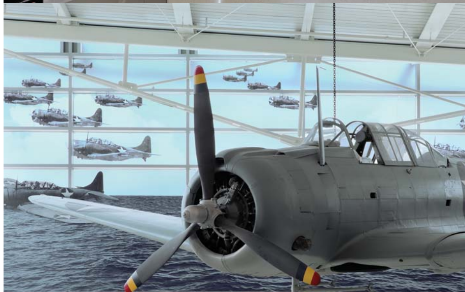
TOP "The Battle" Interactive Kiosk