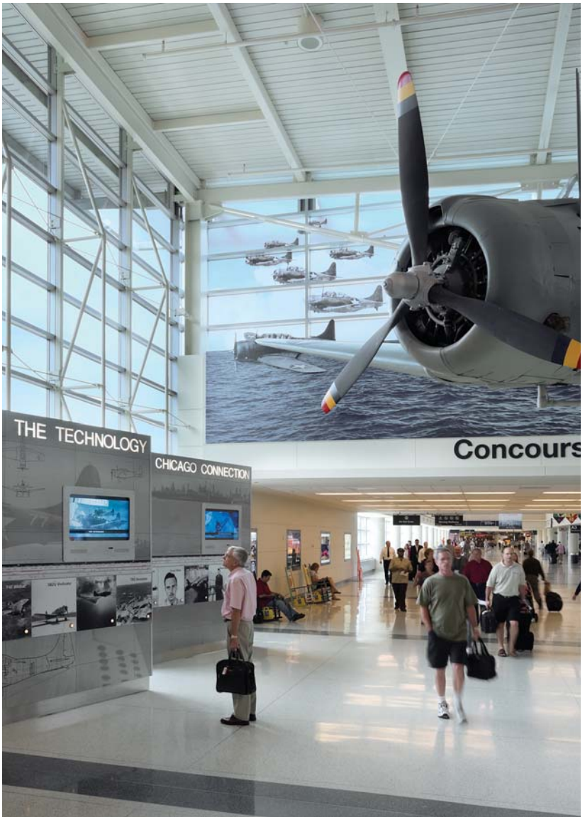
SBD Dauntless Memorial Exhibit