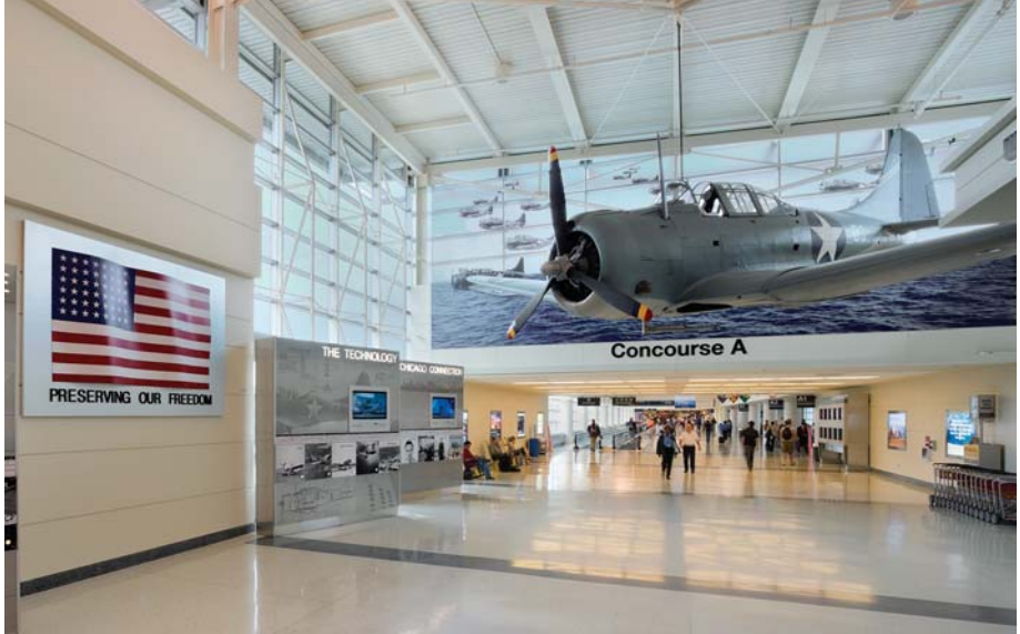
TOP Sponsors of the SBD Dauntless Exhibit