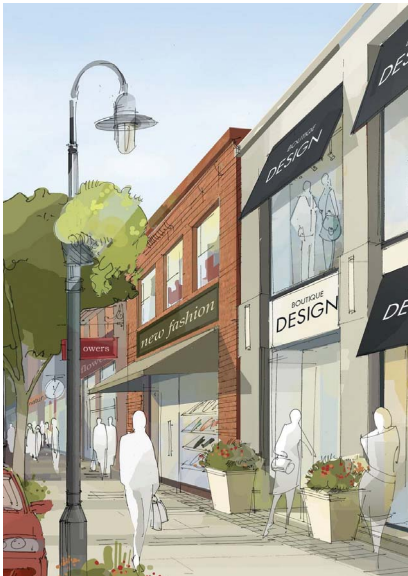
IKEA - Poznan Boulevards