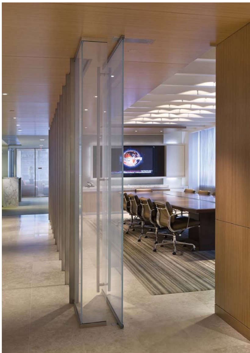
Oaktree Capital Management NEW YORK, NEW YORK