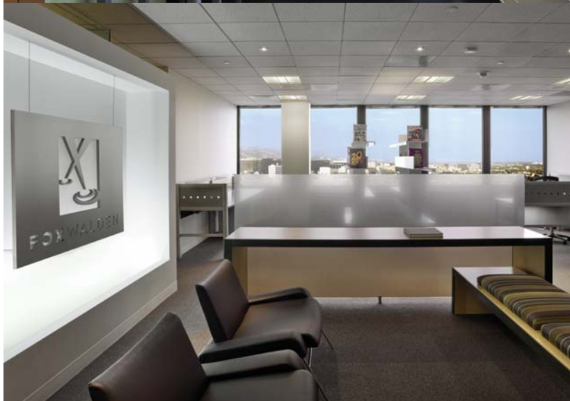
Anschutz Film Group LOS ANGELES, CALIFORNIA